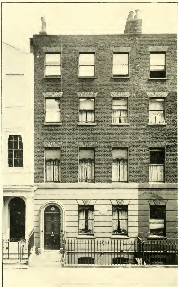
CHRISTINA GEORGINA ROSSETTI'S BIRTH-HOUSE. 110 Hallam Street, Portland Place; formerly 38 Charlotte Street.